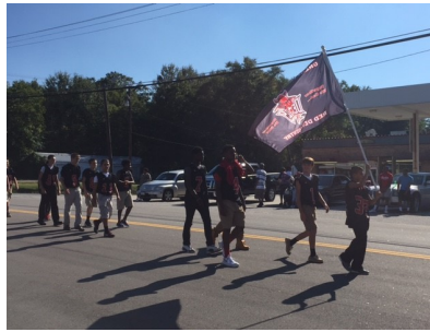
Middle School football team waves the GFMH flag during the Homecoming Parade on September 29th.

We can't dress up every week (as much as many of us would like to), but we can still give a helping hand. Keep our school clean, show up to games, keep cheering even when it seems like the end.