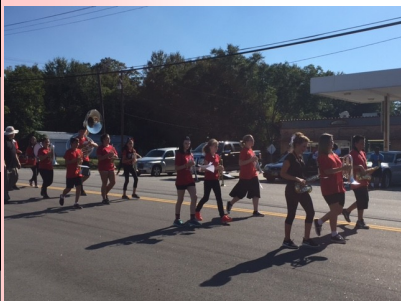
Great Falls High School band team in the parade.