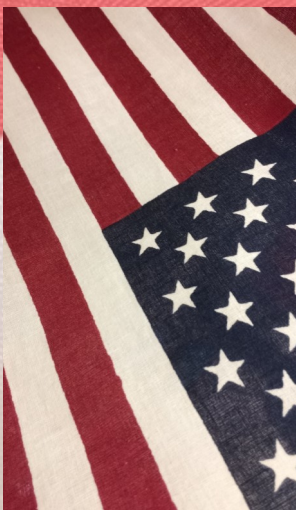
The American Flag that so many have fought to keep hanging high.

Follow this link to see the video : What does Veterans day meant to you?