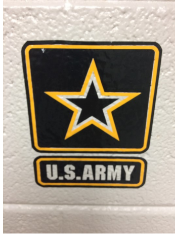
US army Symbol