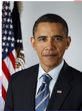
Official Portrait of President Obama

Well Obama, it's been eight great years, but now it's time to pass the presidency torch to another contender. Let's take a moment to reflect on Obama's life and his presidency. Barack Hussein Obama was born in Honolulu, Hawaii on August 4th, 1961 to Ann Dunham and Barack Obama Sr. Obamas father left the family when he was two and moved to Kenya, his mother's country, where he died in an automobile accident almost 20 years later.