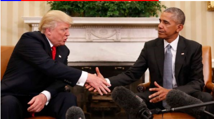
Donald Trump meets with President Obama.

"Clinton to Offer Remarks in New York City." CNN. Cable News Network, n.d. Web. 11 Nov. 2016