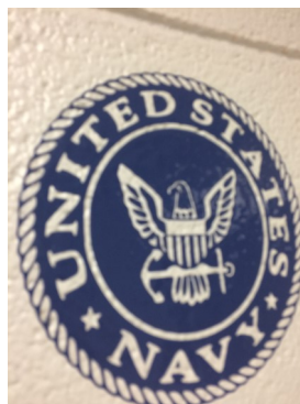
The United States Navy Symbol

The ceremony was not just to honor local veterans but also to