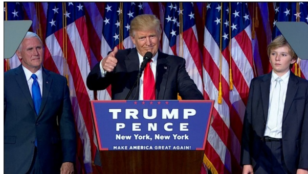
Donald Trump after learning he won.

Tuesday November 8th, many Americans rushed to vote. According to