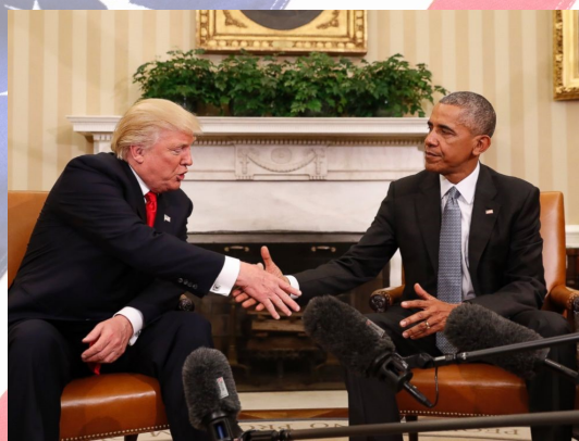
President Obama and Donald Trump shake hands.

successful part of Obama's career was in 2004 when he gave a powerful speech at the democratic national con-