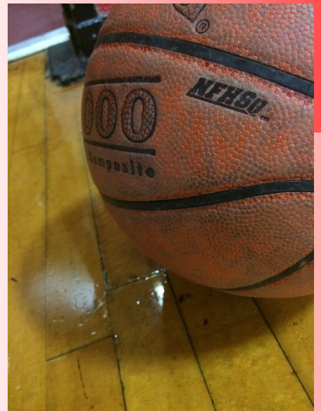
Basketball is fun and exciting

Just remember to stay focused, don't give up, and GET ON THE DEVIL LEVEL!