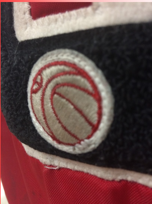
Basketball on a graduated students Varsity Letter